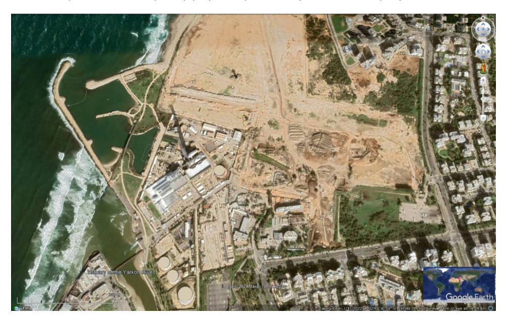
Figure 1: Aerial view of Reading Power Station, cooling water basin and rubble mound breakwaters.

1.5. The services from this solicitation are expected to be performed partly in the suppliers' place of normal operations and partly physically at or adjacent to the project site.